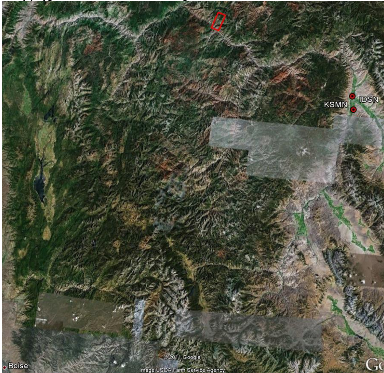
Figure 1 – Shape and location of survey polygon (Google Earth).

The survey area consisted of a polygon located 145 miles Northeast of Boise in Idaho. The survey polygon is shown with red outline in figure 1.